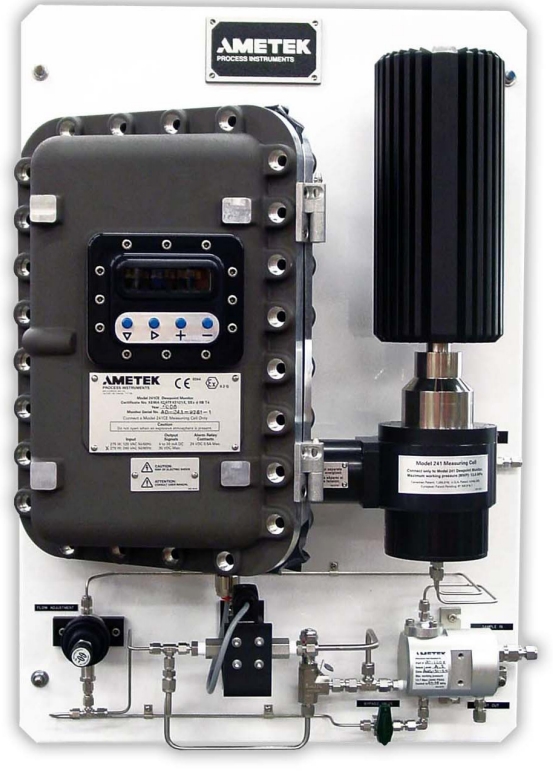
Model 241CE II Hydrocarbon Dew Point Analyzer - European version shown on backpan. Analyzer must be installed in an environmentally controlled building or shelter.

A fully integrated sample system package, including proprietary multiple stage filtration specifically designed for natural gas samples, protects the analyzer from common natural gas contaminants (aerosols, particulates and liquid slugs) and ensures reliable, fast, and accurate means of detecting the hydrocarbon dew point temperature in natural gas applications.