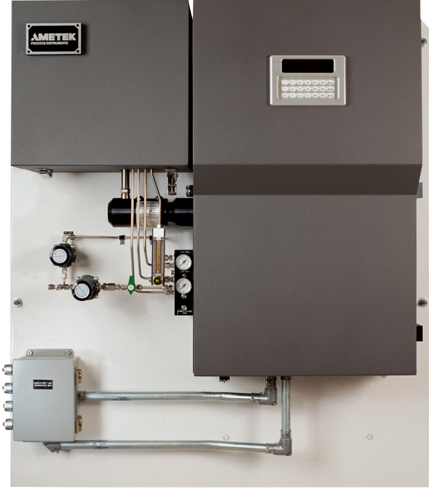
Model 900 Air Demand Analyzer